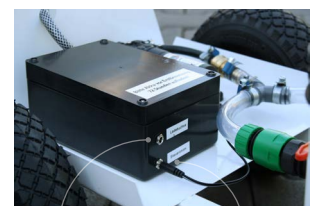
charging socket Control current