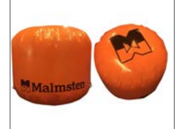
1310014 Open water buoy - Smal