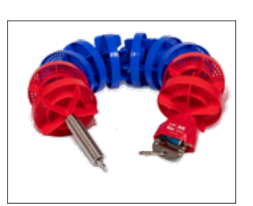
1010002 Racing Lane Line Malmsten Gold Ø 150 m