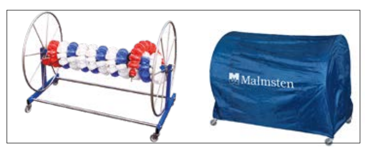
1012001 Storage Trolley for Lane Line Malmsten1050006 Cover for Malmsten Storage Trolley