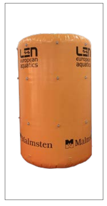
1310013 Open water buoy - Large